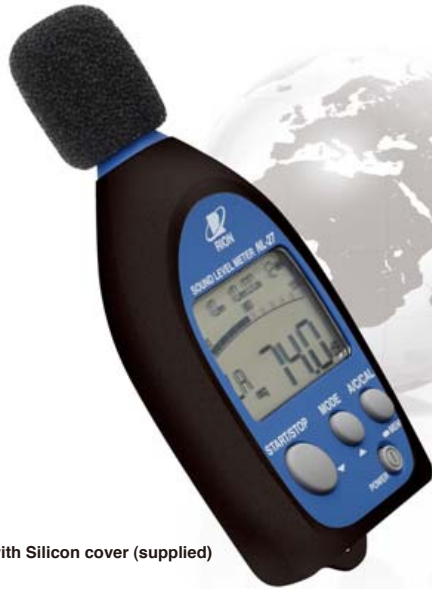
View with Silicon cover (supplied)